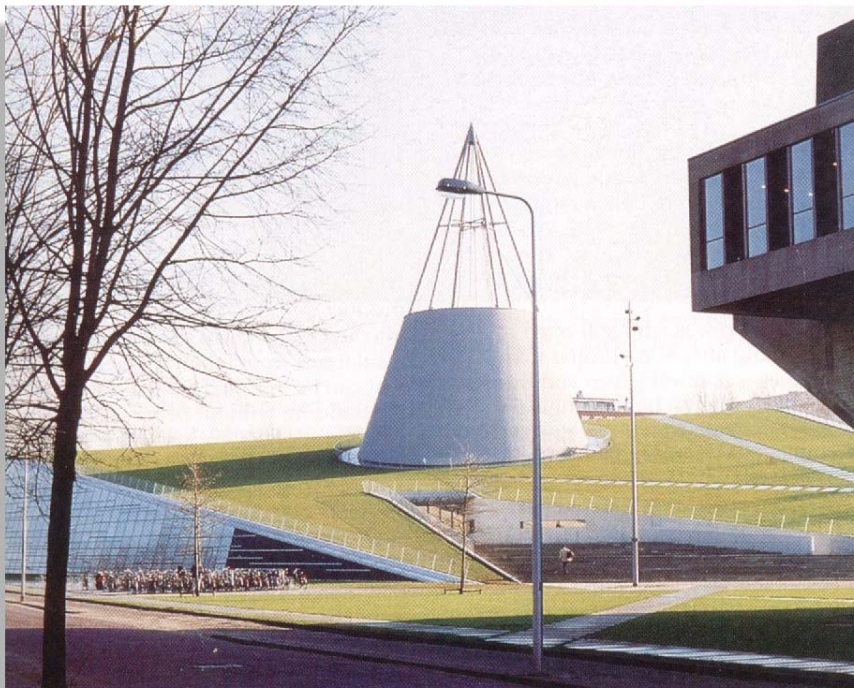
Firestone RubberGard® EPDM used in a Green Roof System Delft Technical University Library, Netherlands.

A guide to the environmental benefits of the RubberGard® EPDM Single Ply Roofing System.