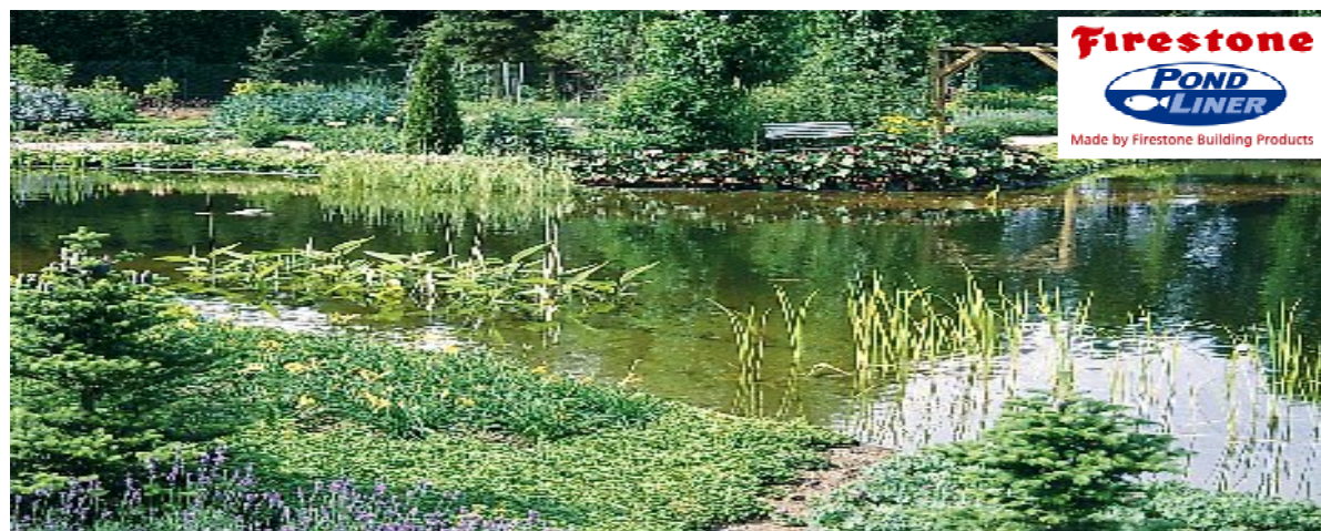
Firestone EPDM Pondliner used in an ornamental pond. Further details are available on request.